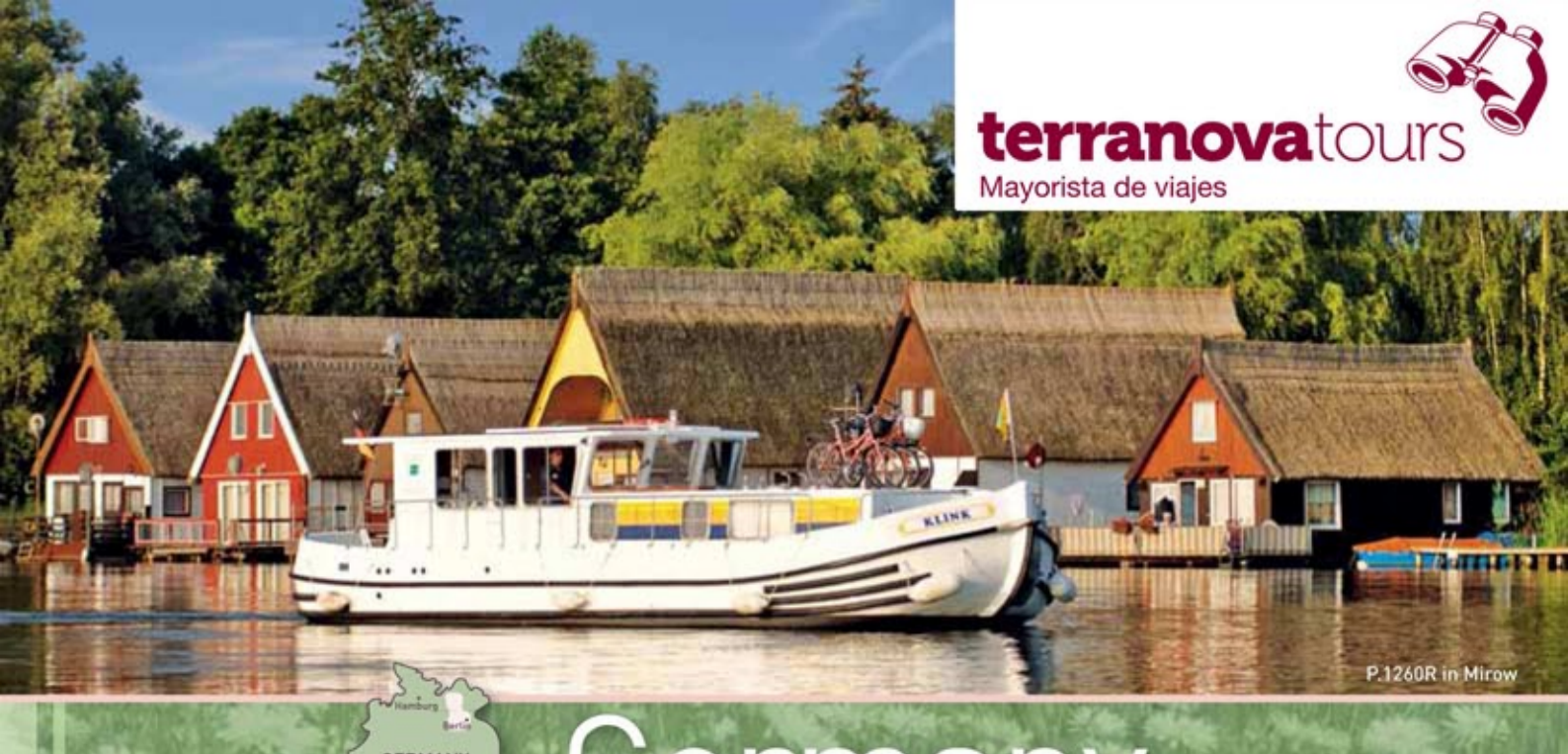
P.1260R in Mirow