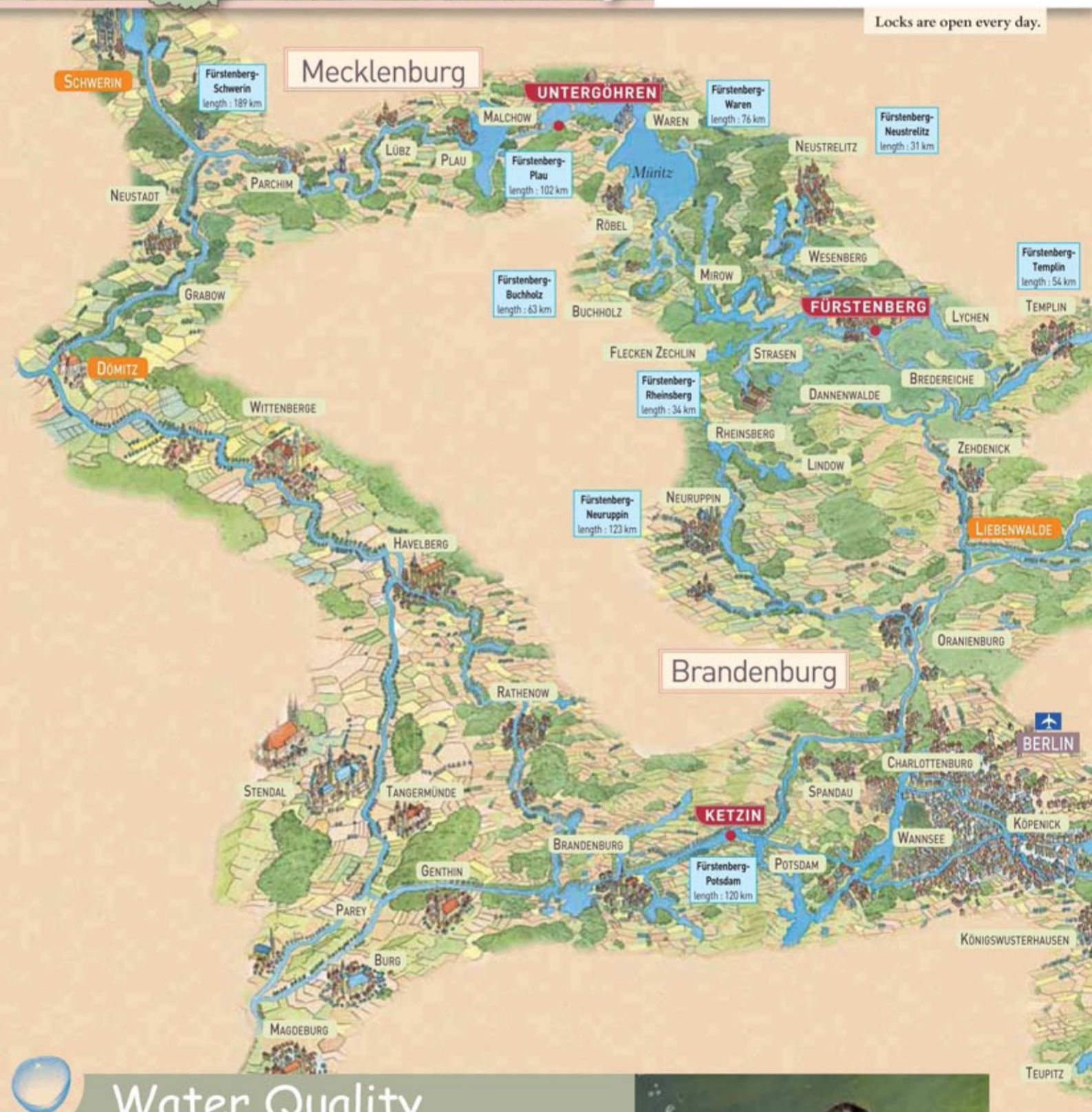
Locks are open every day.